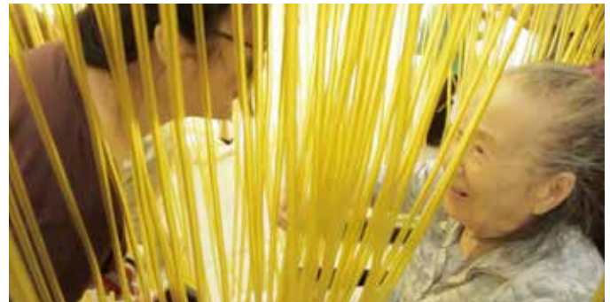
POV: Wisdom Gone Wild

8 Billion Angels 8:15 Hiroshima: From Father to Daughter A Thousand Pebbles on the Ground Agatha Christie: Lucy Worsley on the Mystery Queen (series) American Experience (series) American Masters (series) Armed with Language Art and Pep Asian Americans (series) Awadagin Pratt: Black in America Barry Farm: Community, Land and Justice in Washing Becoming Frida Kahlo (series) Before They Take Us Away Behind the Strings Being 80 Bob Dole, Italy and World War II Breath of Freedom Bring Her Home Cara Romero: Following the Light Come Back Anytime Composer: Amy Beach Covenant of the Salmon People Dear Sirs