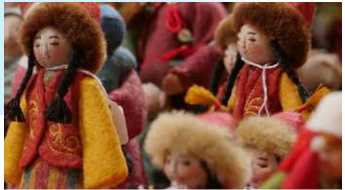
Craft in America