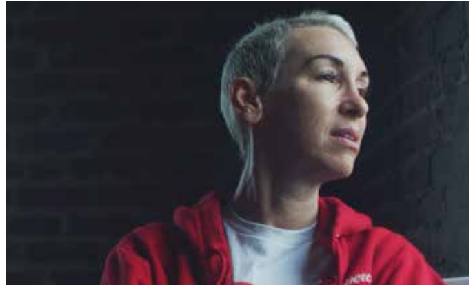
The Adventures of Super CW

Classicalia Crane Candlelight Concert Ella Wishes You a Swinging Christmas with Vanessa Williams Elvis Presley: '68 Comeback Special Frankie Valli & The Four Seasons: A Life on Stage Grand Sumo Highlights (series) Johnny Cash: Man in Black – Live in Denmark 1971 Legends of the Canyon Nutcracker and the Mouse King Roots of Comedy with Jesus Trejo (series) Season of Light: Christmas with the Tabernacle Choir St. Thomas Christmas Starstruck: Gene Kelly's Love Letter to Ballet Sumopedia (series) The Great American Recipe (series) Thrill of Hope: A Concordia Christmas