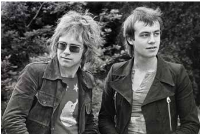
Elton John & Bernie Taupin: The Library of Congress Gershwin Prize

A Brief History of the Future (series) Accidental Host: The Story of Rat Lungworm Disease Animals with Cameras, A Nature Miniseries Below the Belt: The Last Health Taboo Changing Planet (series)