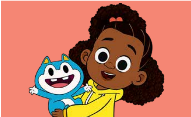
Lyla in the Loop