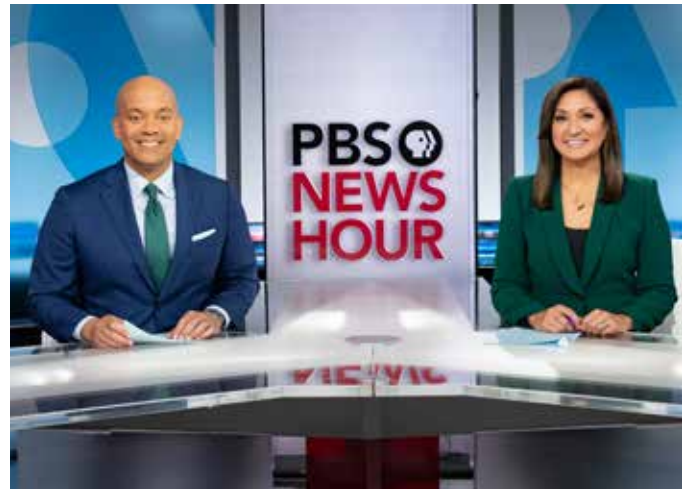
PBS News Hour