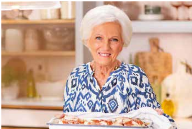
Mary Berry Makes It Easy