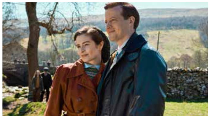
All Creatures Great and Small on Masterpiece