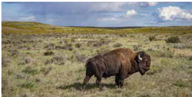
The American Buffalo

A Long March America Outdoors with Baratunde Thurston (series) America: The Land We Live In American Buffalo (series)