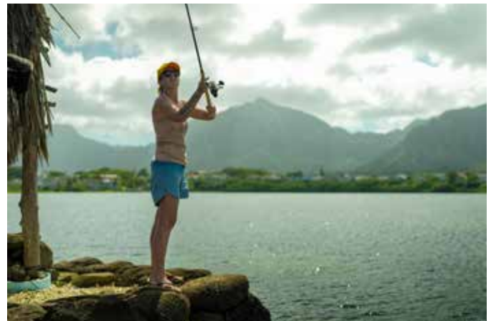
Hope in the Water