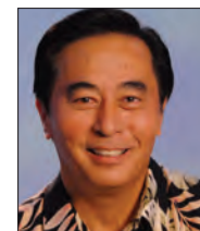
Les Murashige O'ahu