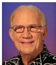
Robbie Alm Chair